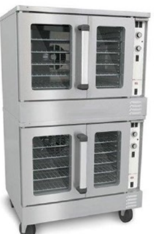
Double Convection Ovens $7000