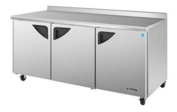
Worktop Refrigeration—2 needed $3300 each