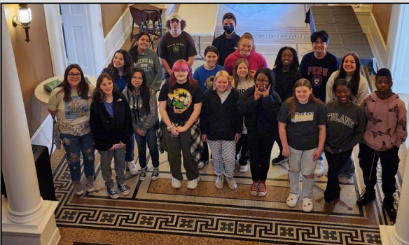
Crawfordsville High School's Diversity Club helped with a project recently